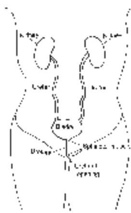
Front-facing cross-sectional view of the female urinary tract

In an uninjured system, the bladder is relaxed and at rest until it becomes filled with urine and starts to stretch. When it has filled beyond about 10 ounces, most people will begin to feel an urge to urinate. When our brain receives the message that the bladder is full, we empty our bladder. The bladder contracts and forces urine from the bladder and out of the body through a tube called the urethra. In males, the urethra travels through the end of the penis. In females, the urethra emerges just above the vaginal opening. This difference in anatomy affects bladder management choices.