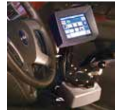
Electronic control systems