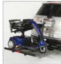
Lifts and stowage products